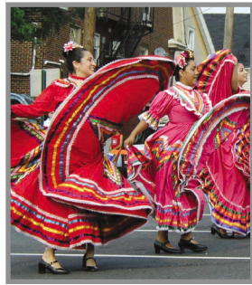
Summer festivals celebrate the rich cultures of the neighborhood.

A variety of recreational and cultural activities abound.